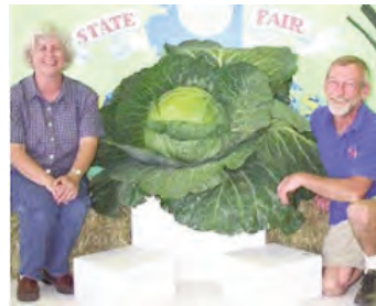
This head of lettuce (above) weighs over 100 pounds, and the flower (below) grew from seeds that are over 32,000 years old.

Grow a flower in a cup- at http://www.kidsgardening.org/node/3914 you will find everything you need to plant your own seed in a cup. You'll need a styrofoam cup with a small hole in the center. Easy flowers are marigolds or pansies; easy vegetables are corn or watermelon, which will sprout in about 5 days.